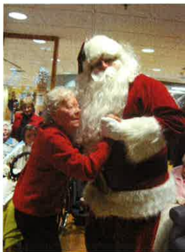
A dream come true!