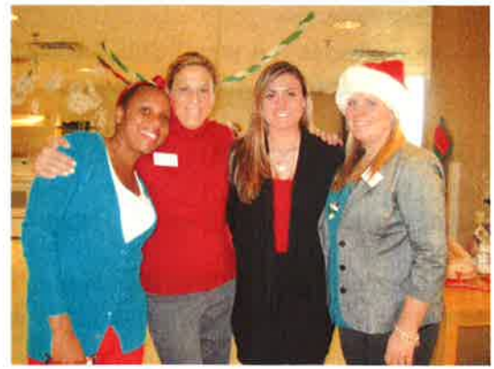
and the ladies that make them happen!