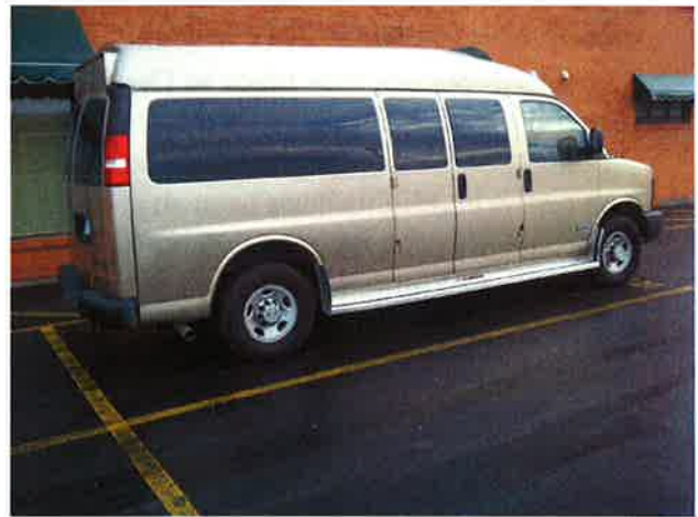
“Big Benny” is driven weekly by Gallery Volunteers