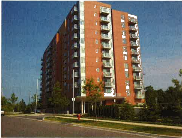
The Gallery in all its glory!

The Land use Committee has been for the most part inactive. A couple of members have been involved in trying to close out The Gallery project. All servicing work on Halton Hills Drive has been completed and the final contractor's holdback has been released. There are some minor deficiencies remaining on the building contract but with little effort on the part of the contractor to complete them. We are considering confiscating the remaining holdback and completing outstanding issues using our own forces. Efforts continue to satisfy the Town with respect to a couple of minor issues in order for the Town to release the remaining security that they are holding in Letters of Credit. Those associated with building the Gallery remain very proud of this accomplishment!