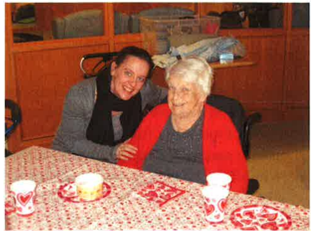
There is always time for a party at the Bennett Centre!